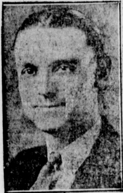
HONEST - - - CAPABLE EFFICIENT

I have lived and worked in West Texas for the past 28 years and I am familiar with the problems and needs of the people in West Texas.