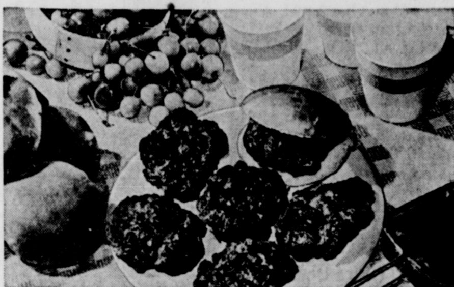
WHEN YOU PLAN A PICNIC FOR A CROWD (Recipes Below.)

Community picnics are fun! They offer an opportunity for a carefree day under the open sky—carefree for even the chairman in charge of affairs, if she's planned her program well and chosen her helpers wisely.