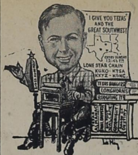
(By Boyce House)

"Crime doesn't pay" has been the theme of many speeches and editorials—but it does. Crime pays the writers for the true detective magazines.