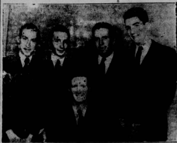
Pictured above is the popular "Stamps Great Plains Quartet" which will render a program in Dimmitt Saturday night, August 24, at 8:30 o'clock under the auspices of the Dimmitt Lions Club.

The sale was unique in that it offered in excess of 12,000 certified veterans an opportunity to inspect the vehicles at any of the 16 Army Camp locations through North and West Texas and make their purchase by mail, with alternate choices given, since the oldest certificate holders sending in an order strict chronological order. The sale was awarded their choices in resulted in the disposal of 457 out of the 648 vehicles of all types, including passenger cars, Jeeps, station wagons, motorcycles, scooters, trucks, trailers and truck tractors, WAA officials announced.