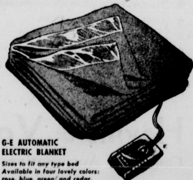
G-E AUTOMATIC ELECTRIC BLANKET

The Automatic Blanket is carefully made to meet rigid safety standards, and is approved by the Underwriters' Laboratories, Inc. It is certified washable by the American Institute of Laundering.