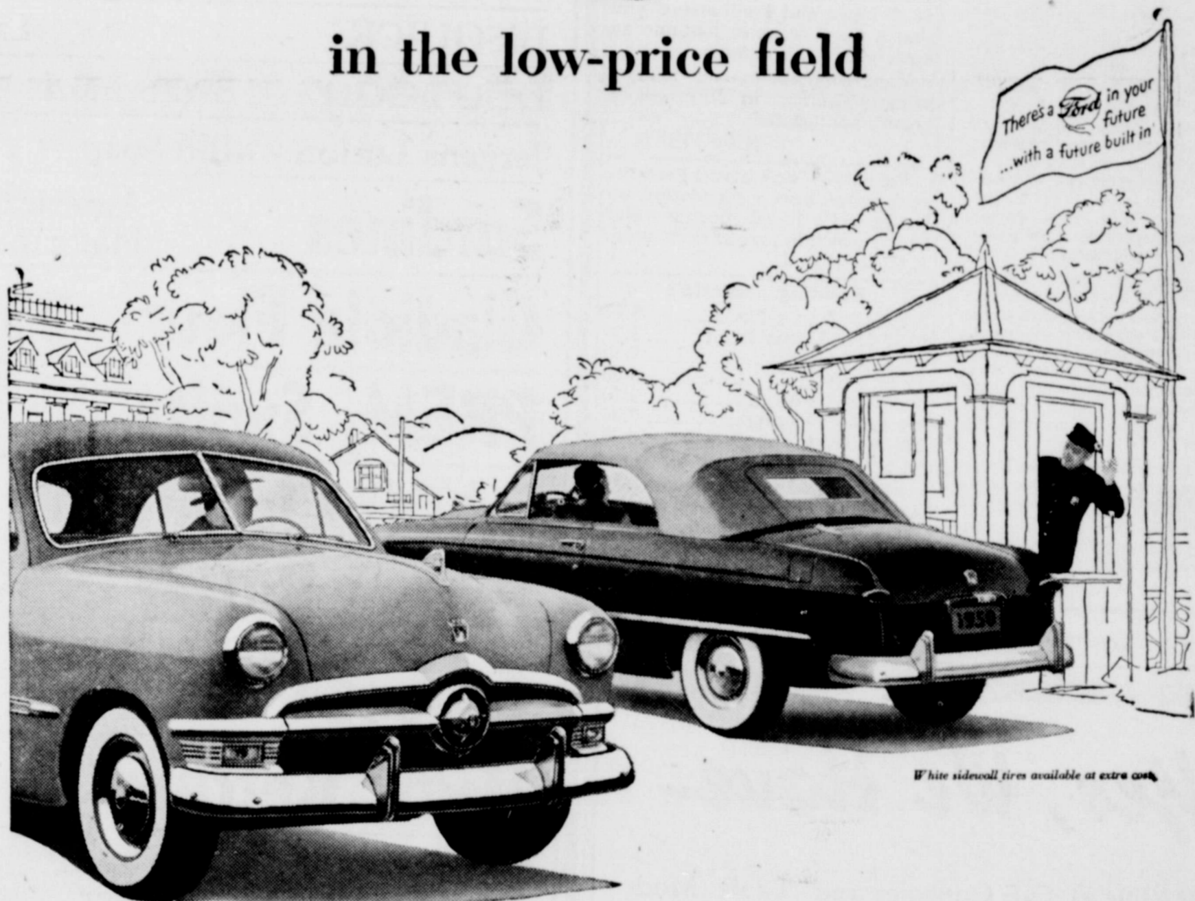
White sidewall tires available at extra cost.