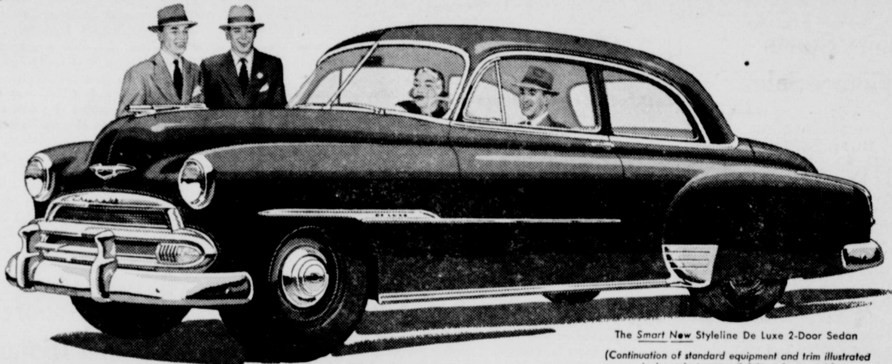
The Smart New Styleline De Luxe 2-Door Sedan

(Continuation of standard equipment and trim illustrated is dependent on availability of material.)