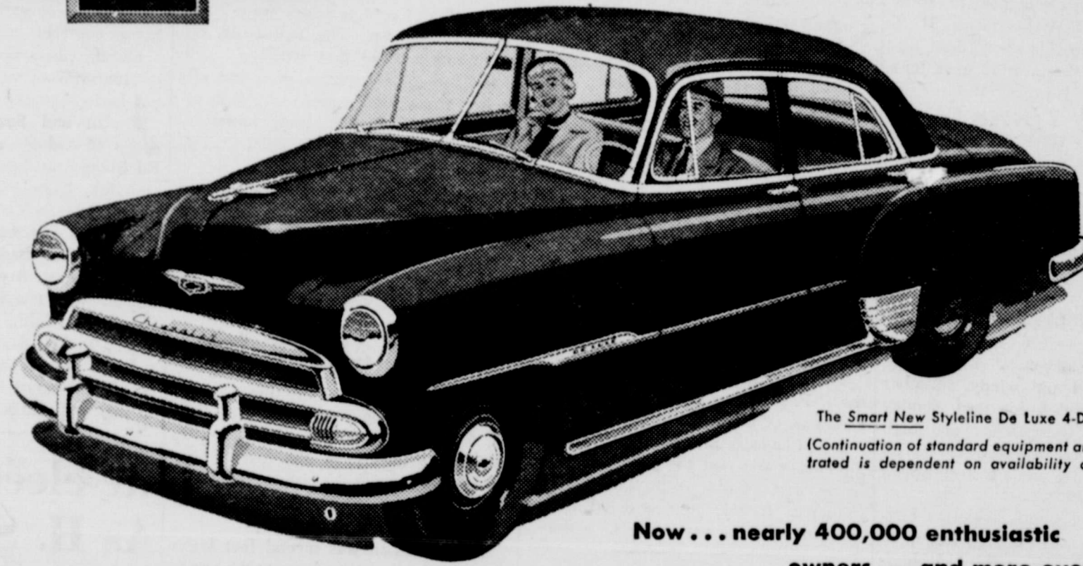
The Smart New Styleline De Luxe 4-Door Sedan (Continuation of standard equipment and trim illustrated is dependent on availability of material.)

Now... nearly 400,000 enthusiastic owners... and more every day!