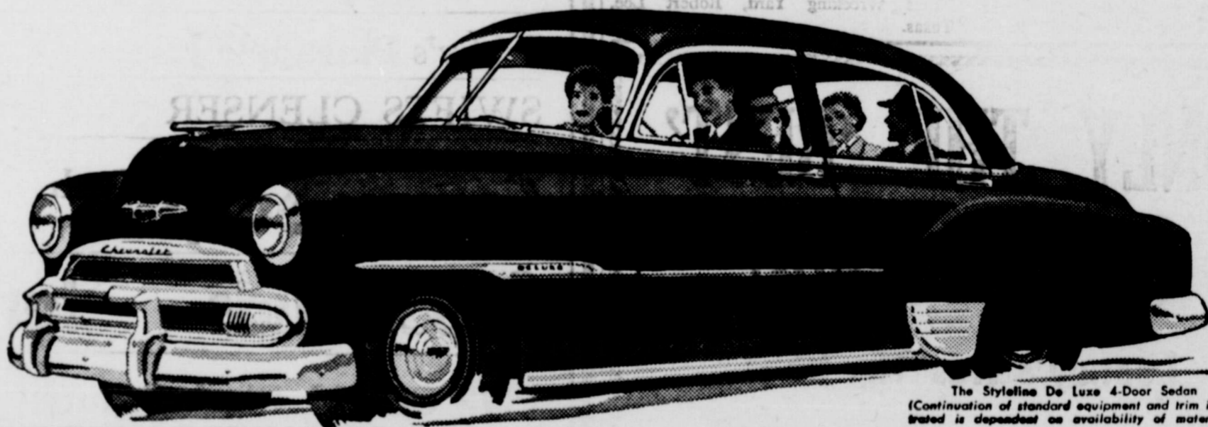
The Styline De Luxe 4-Door Sedan (Continuation of standard equipment and trim illustrated is dependent on availability of material.)