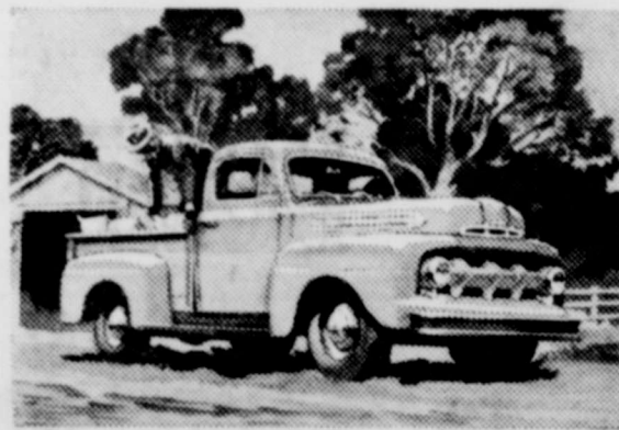
FEED , milk, poultry, grain—farmers in Economy Run 'ound Fords hauled 'em at mighty low cost per mile! F-1 and all Fords offer TWO new cabs!