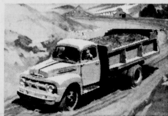
GRAVEL travelled on tough off-road jobs in Economy Run—money saved every mile with the Power Pilot! F-5 is top heavy duty seller!

... the 48-State Economy Run points the way to more miles per dollar with the Ford POWER PILOT!