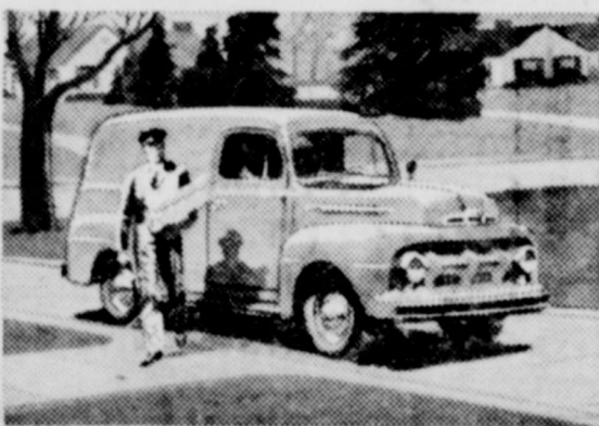
FLOWERS get there quicker, fresher in nimblar Fords! Economy Run drivers found Fords cut costs on stop-and-go jobs. F-1 has new fingertip shift!