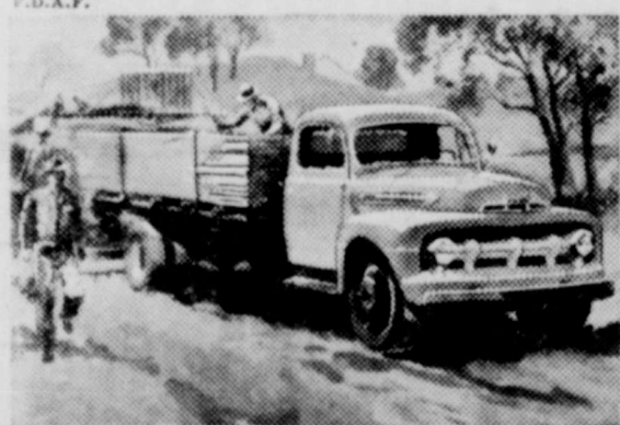
LUMBER and all building materials were hustled in the Economy Run—at low ton-mile cost! F-6 gives choice of three great truck engines!