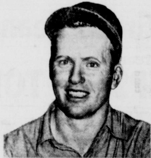
"3200-lb. loads ... 2.3c a mile!"

The result: overwhelming new evidence that Ford Trucks with the POWER PILOT save you money every mile! The POWER PILOT gives you the most power from the least gas!