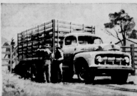
CATTLE went on wheels for less per mile in the Economy Run. F-6, like all Fords, has new Free-Turn valves, other advancements, V-8's or Sixes!