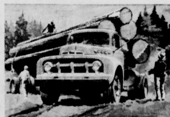
LOGS moved to mills at lower cost, more profit in Economy Run. 145-h.p. engines power these F-8 Big Jobs. Ford offers over 180 truck models!