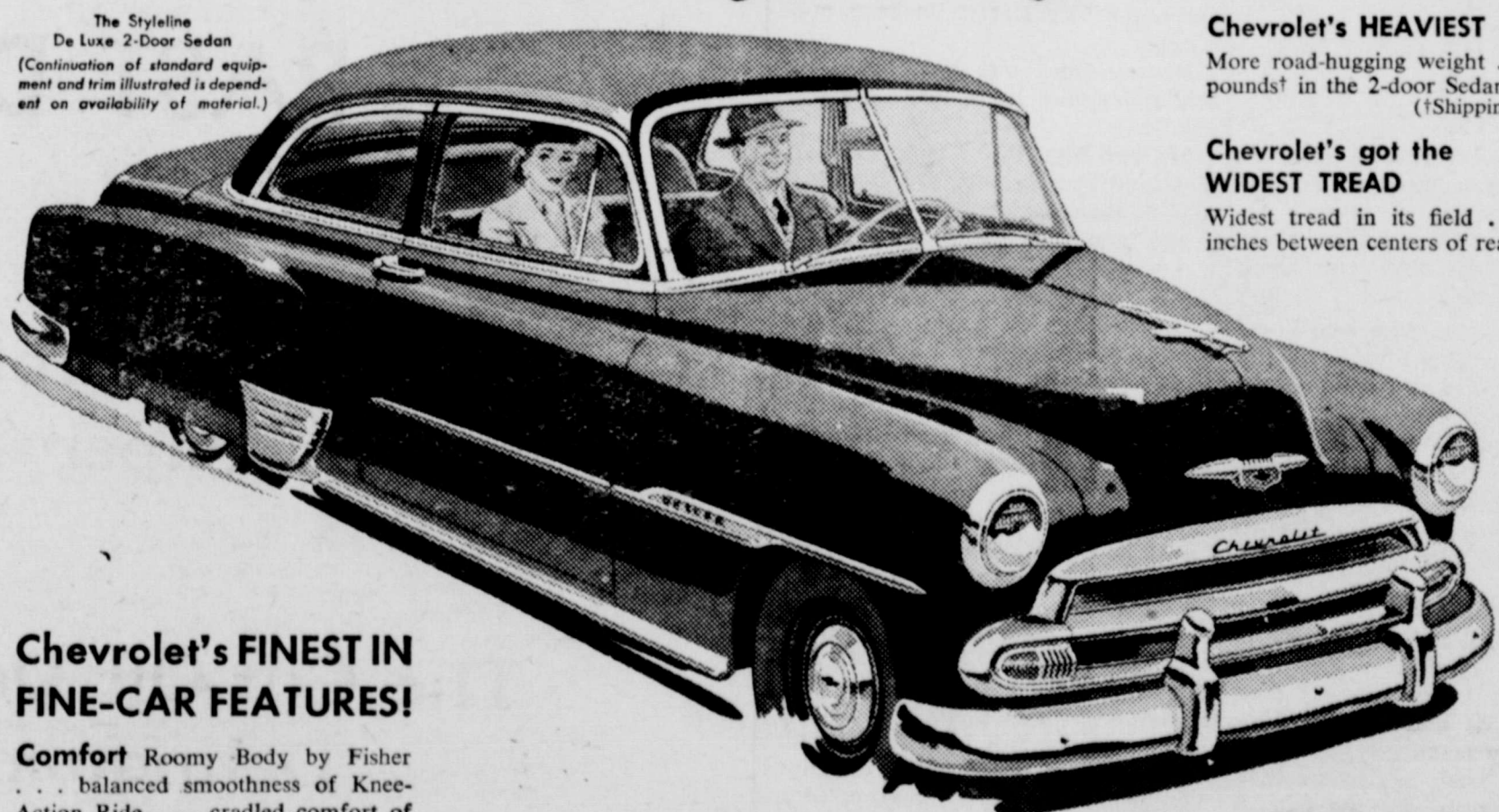
The Styleline De Luxe 2-Door Sedan (Continuation of standard equipment and trim illustrated is dependent on availability of material.)