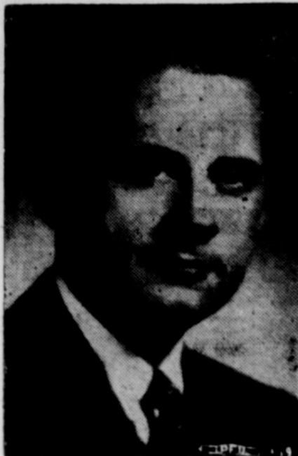
ALLAN SHIVERS Retains Governorship