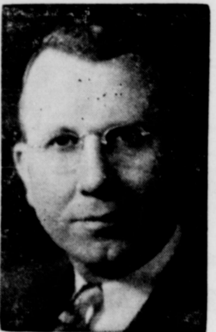
O. C. FISHER Going Back to Congress