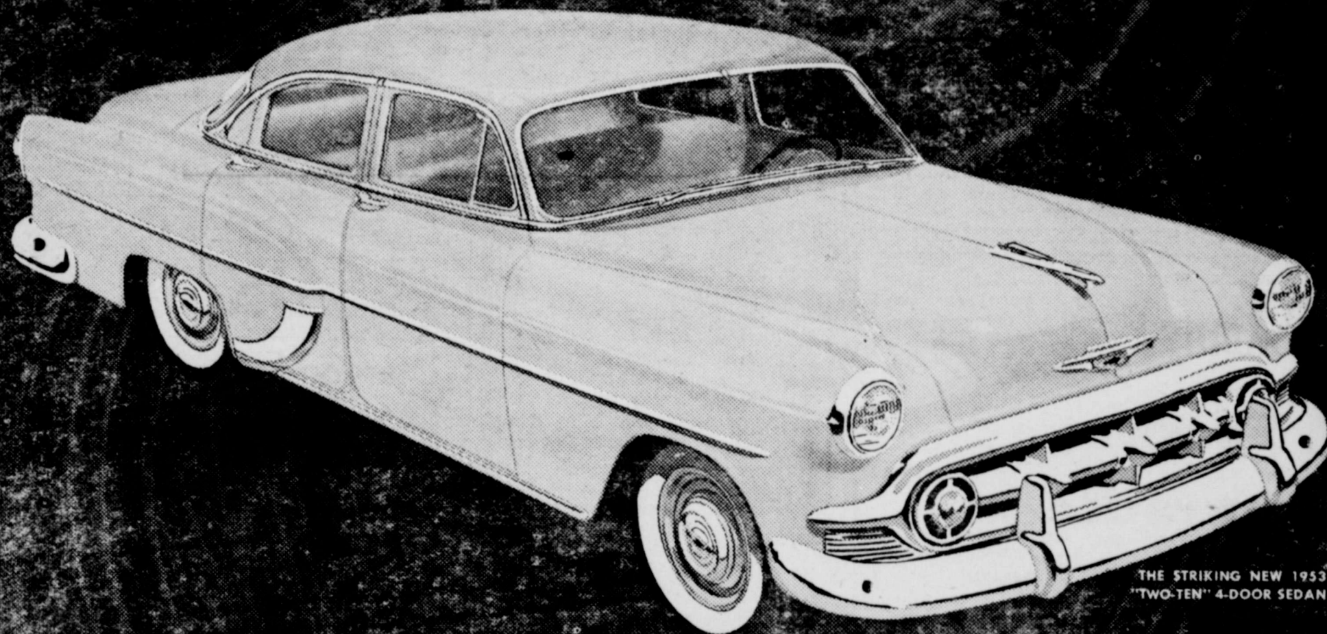
THE STRIKING NEW 1953 "TWO-TEN" 4-DOOR SEDAN

So startlingly new! So wonderfully different!