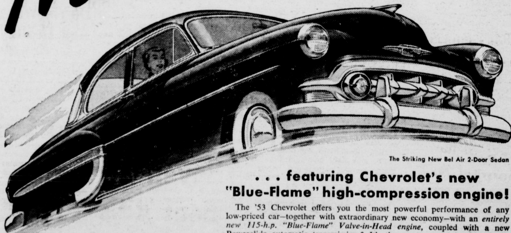
The Striking New Bel Air 2-Door Sedan

Most powerful car in the low-price field!