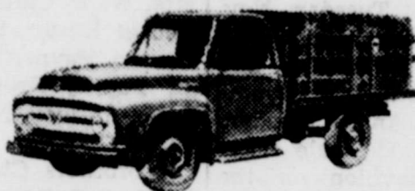
Light duty truck with a heavy duty heart! Ford's new F-250 Stake-Platform gives you over 7½-ft. length by 6-ft. width to handle bulky loads. G.V.W. 6,900 lbs. Driverized Cab! Choice of Cost Clipper Six or Truck V-8.