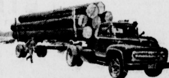
Nation's biggest seller in its weight class today! New Ford F-800, powered by modern, overhead-valve 155-h.p. Cargo King V-8. 15 models for bodies 7½ to 19 ft. G.V.W. truck rating, 22,000 lbs. G.C.W., 48,000 lbs.