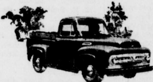
Economy leader of great Ford Economy Truck line! All-new Ford F-100 6½-ft. Pickup with Driverized Cab. 45-cu.-ft. pickup box. Rigid clamp-tight tailgate resists bending and twisting. 101-h.p. Cost Clipper Six or 106-h.p. Truck V-8!

1953 sales have been 42% above last year, so your Ford Truck Dealer can afford to give you his best deal in years! You can get a bargain in any of 190 new Ford Economy Truck models. Synchro-Silent transmission in every model . . . at no extra cost. New set-back front axles for shorter turning! New LOW-FRICTION power! Choice of V-8's, Sixes! All-new Driverized Cabs—world's most comfortable—to cut driver fatigue! Now . . . wheel that old truck in to your Ford Dealer's for the greatest new truck bargains in years!