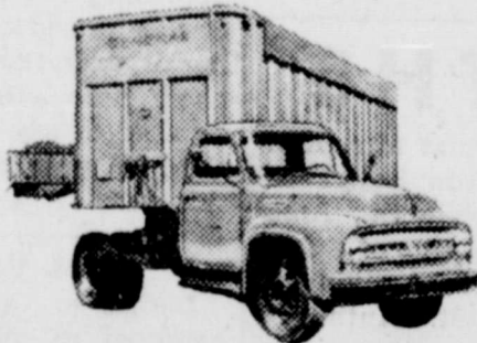
Synchro-Silent transmission at no extra cost in every Ford Truck! Ford F-600, G.C.W. 28,000 lbs., gives choice of Big Six or Truck V-8. Choice of 4- or 5-speed direct or overdrive transmissions, all Synchro-Silent.