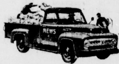
New workhorse added to the Ford line! The Ford F-350 Express with 9-ft. box. New bolted construction. Rigid tailgate. Driverized Cab! G.V.W. of 9,500 lbs. with dual rear tires. G.V.W. of 7,100 lbs. with singles.