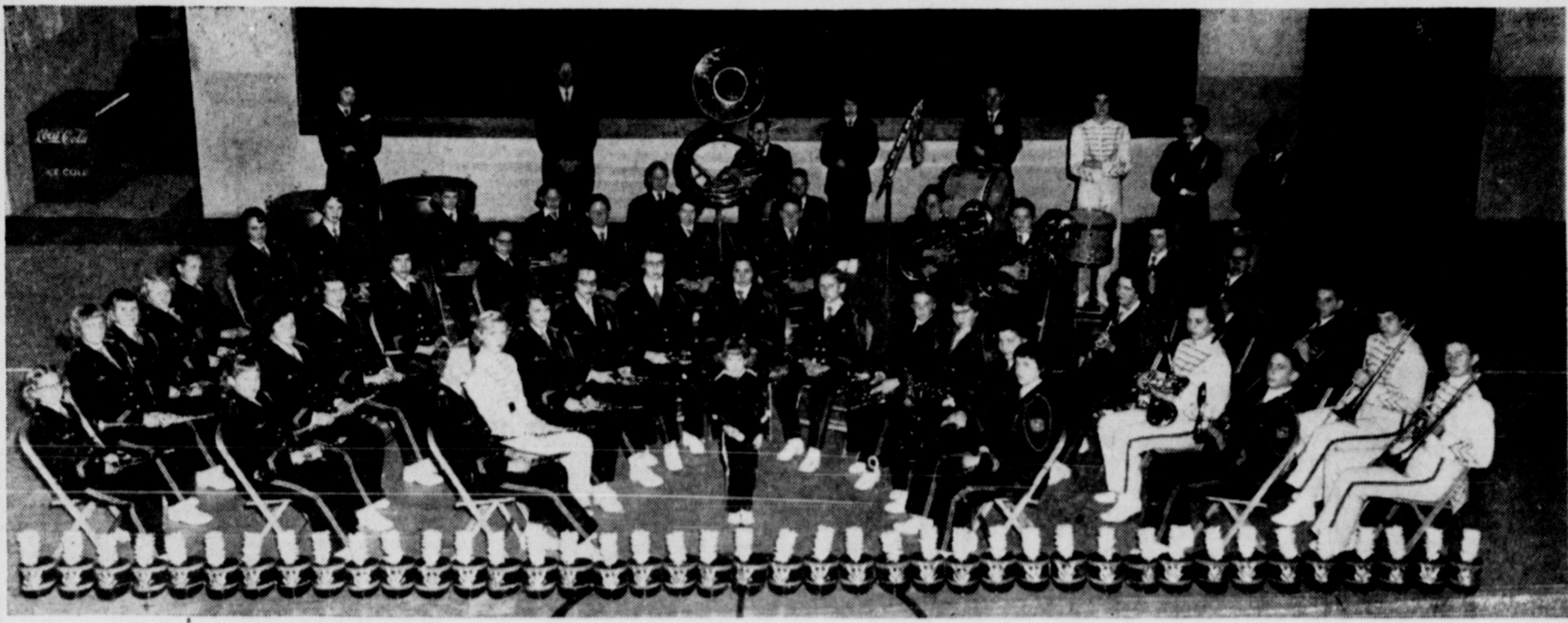
Robert Lee 52-Piece School Band Which Will Give Concert Next Tuesday