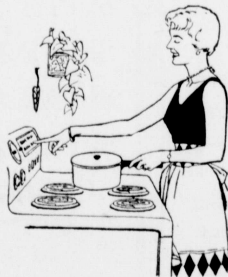
WORK IN COMFORT — electric range helps keep cook and kitchen cooler.

* MORE COMFORT WHEN YOU LIVE ELECTRICALLY!