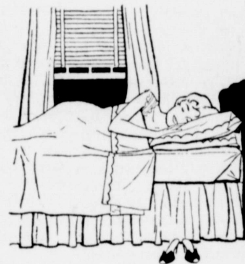
SLEEP IN COMFORT — Electric room air conditioners help keep bedrooms cool.

* MORE COMFORT WHEN YOU LIVE ELECTRICALLY!