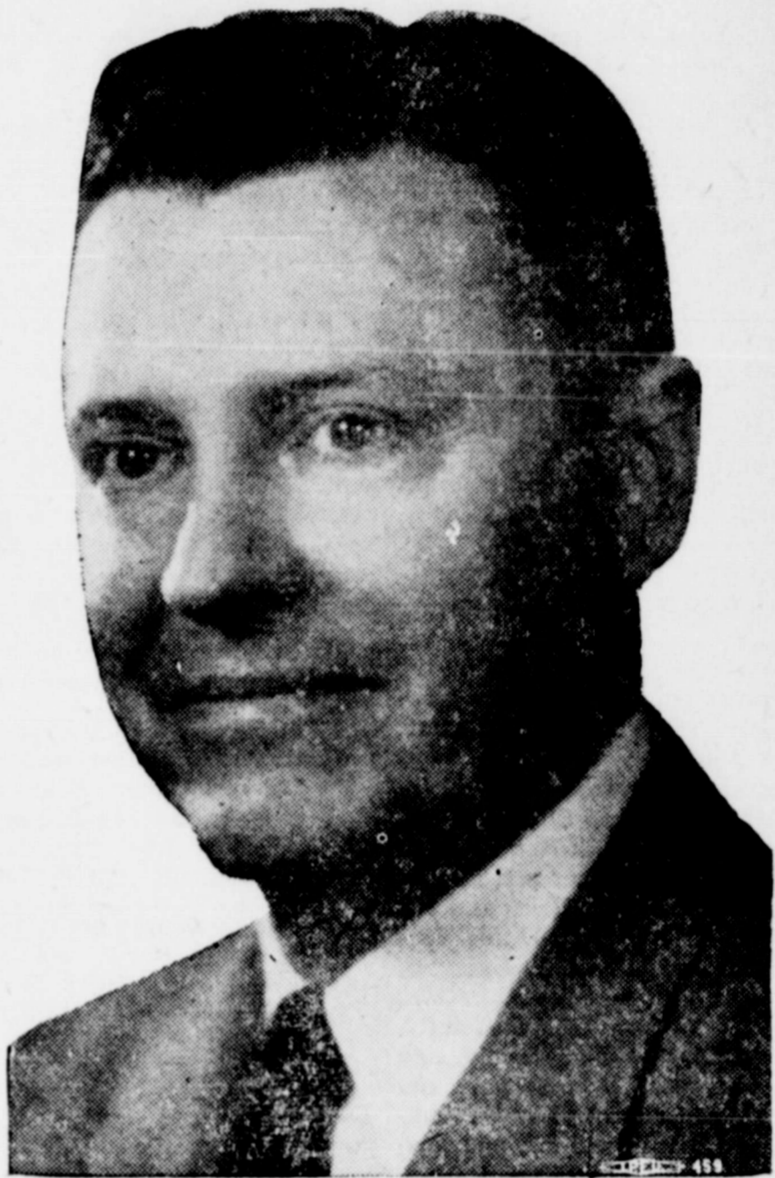
Ralph W. Yarborough