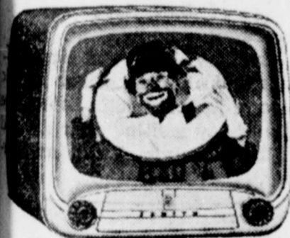
The Chatham, R1800

smartly styled table model in handsome Mahogany or blond color wood cabinet. Matching legs available at slight extra cost.