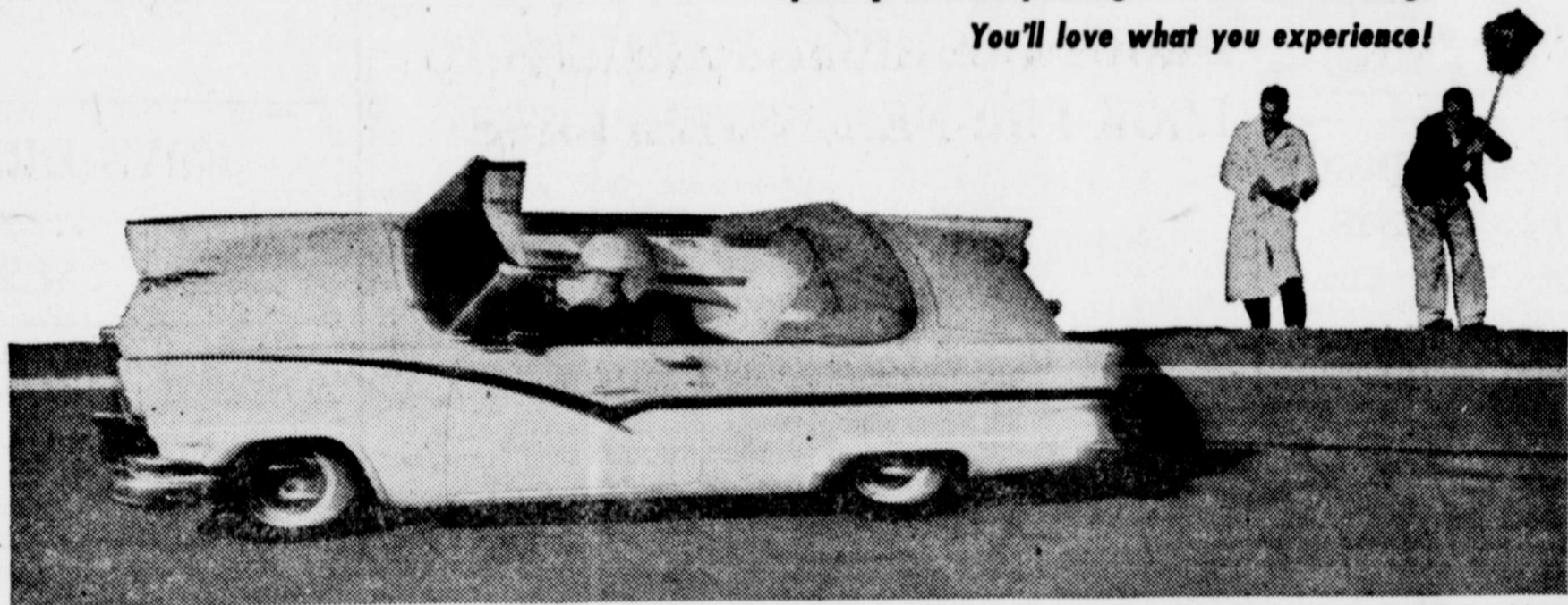
Photographed at world's most modern test track—Ford's new desert proving grounds at Kingman, Arizona.

Discover what happened at the thrilling Kingman, Arizona performance run! Try this Ford yourself . . . for pick-up . . . for passing . . . for hill-leveling! You'll love what you experience!