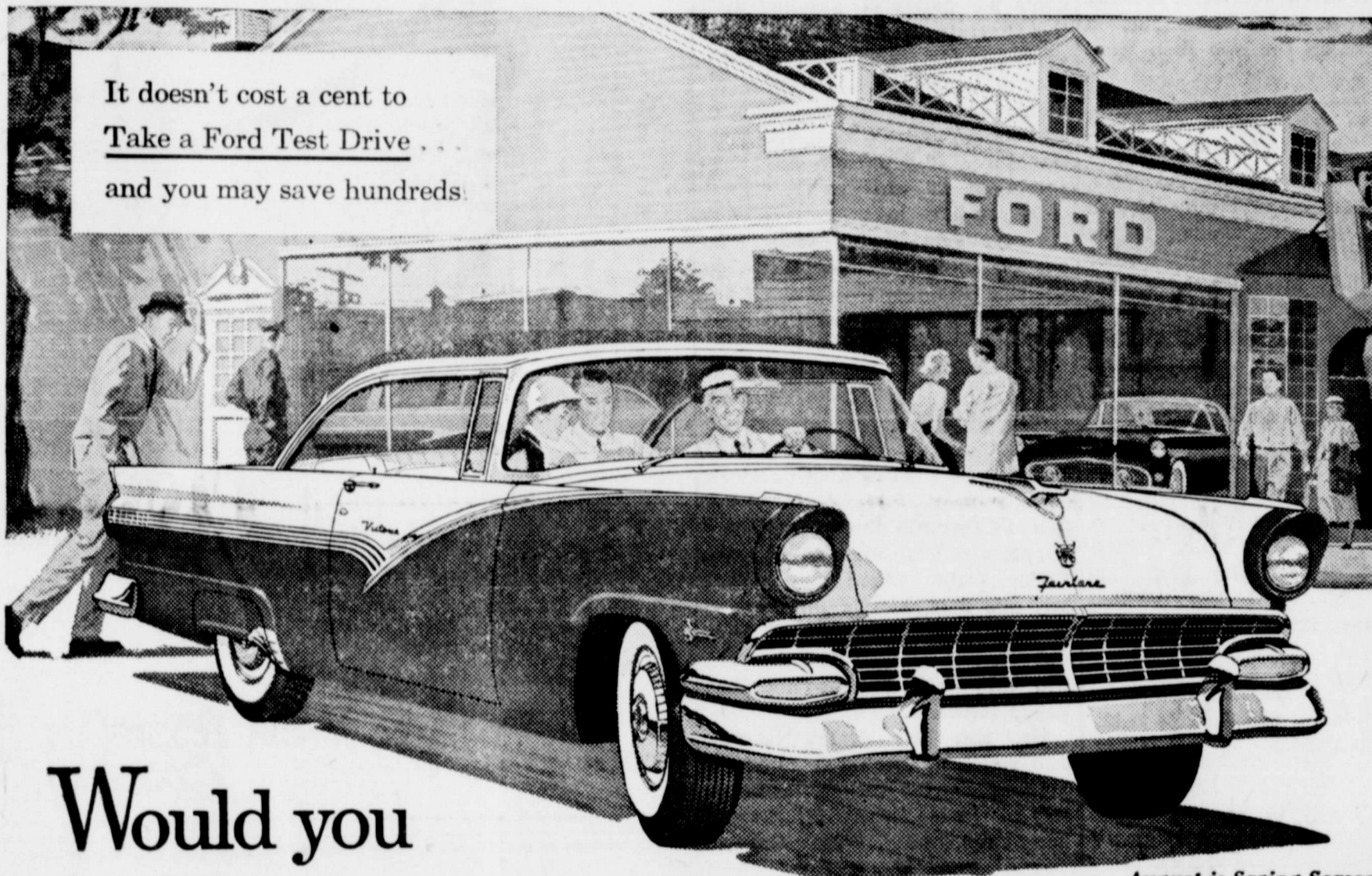
August is Saving Season at your Ford Dealer's. Bag a deal while he clears his decks for the '57 models.

It doesn't cost a cent to Take a Ford Test Drive . . . and you may save hundreds.