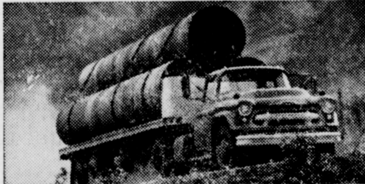
All the way in DRIVE range with Powermatic! This Powermatic-equipped 10000 Series tractor traveled the Alcan Highway in a single forward-speed range!

Only franchised Chevrolet dealers display this famous trademark