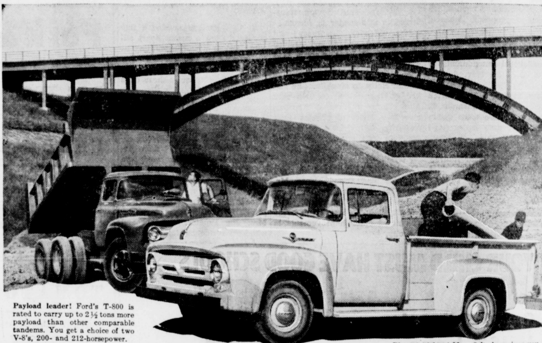
Payload leader! Ford's T-800 is rated to carry up to 2½ tons more payload than other comparable tandems. You get a choice of two V-8's, 200- and 212-horsepower.