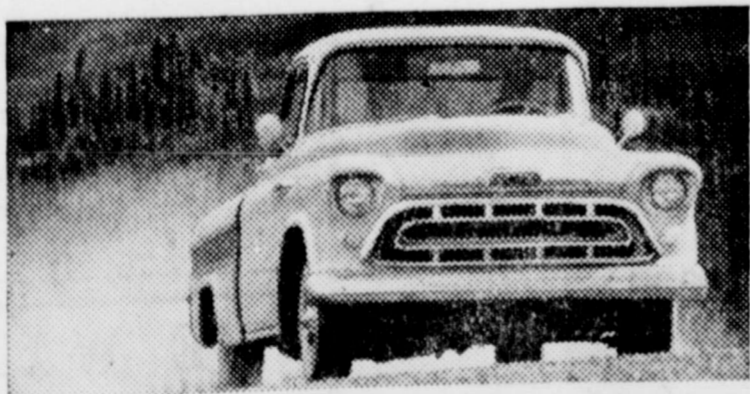
Alcan fleet reports up to 18.17 miles per gallon! That's the mileage reported by the Cameo Carrier, with Thriftmaster 6 and Overdrive (optional at extra cost).

Heavyweight Champs with Triple-Torque tandem are rated at 32,000 lbs. GVW, 50,000 lbs. GCW. Special features include built-in 3-speed power divider.