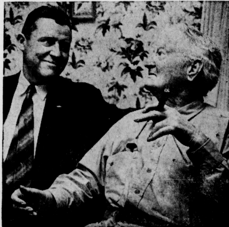
"CACTUS JACK"—John Nance Garner, 89, former vice president of the United States, confers with Judge Ralph Yarborough, candidate for the U. S. Senate in the April 2 special election, at Garner's Uvalde home. Garner's advice to Yarborough, 53, was: "Win son."