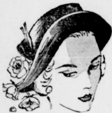
NEW SPRING HATS