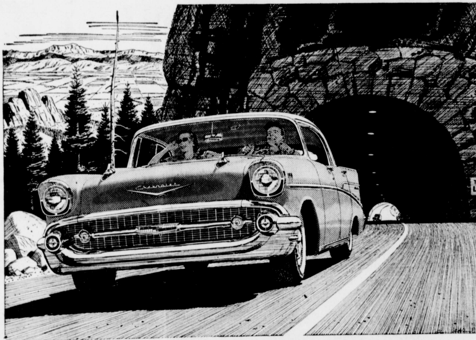
Beautiful in motion—Chevrolet Bel Air Sport Sedan with Body by Fisher.

DON'T BUY ANY CAR BEFORE YOU DRIVE A CHEVY . . . ITS BEST SHOWROOM IS THE ROAD.