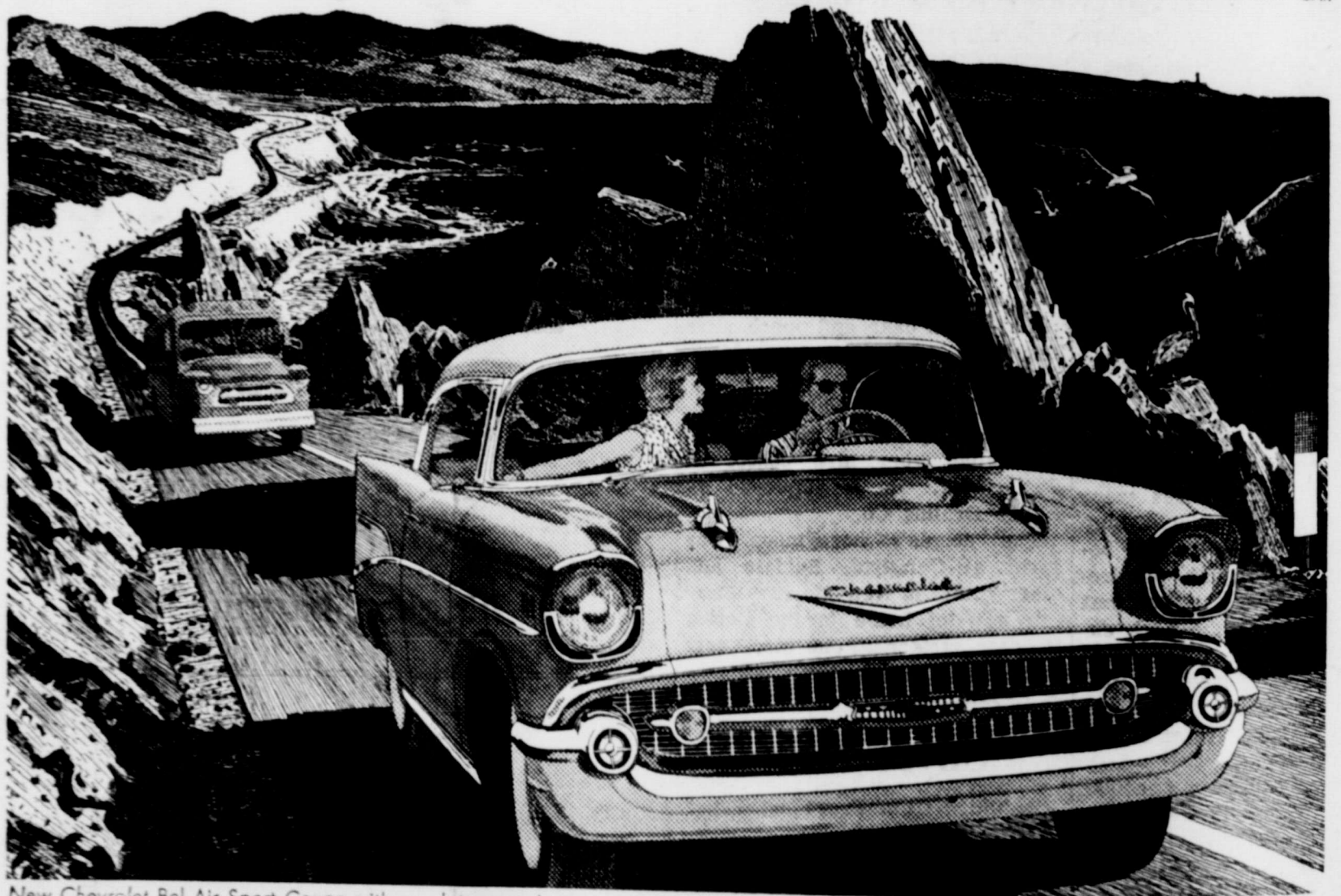
New Chevrolet Bel Air Sport Coupe with spunk to spare!

MORE PEOPLE DRIVE CHEVROLETS THAN ANY OTHER CAR