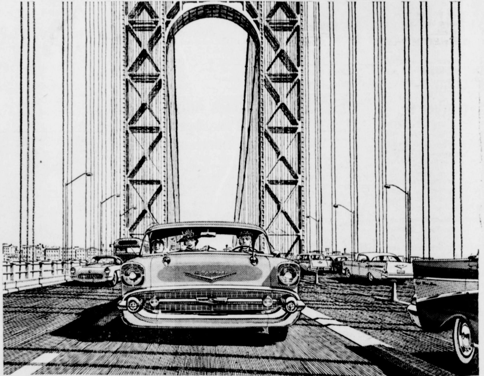
Better try it soon—Chevrolet Bel Air Sport Sedan!

More People Drive Chevrolets Than Any Other Car