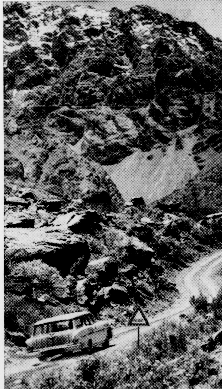
The sure-footed Chevrolet purrs past a road sign that says "danger"— and ahead lies the toughest part of the perilous Andean climb!

Air Conditioning—temperatures made to order— for all-weather comfort. Get a demonstration!