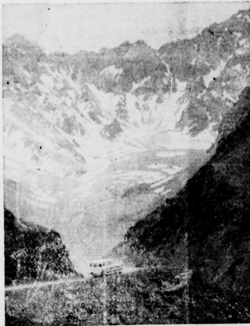
Precision roadability was vital on this wild trail!

Air Conditioning—temperatures made to order—for all-weather comfort. Get a demonstration!