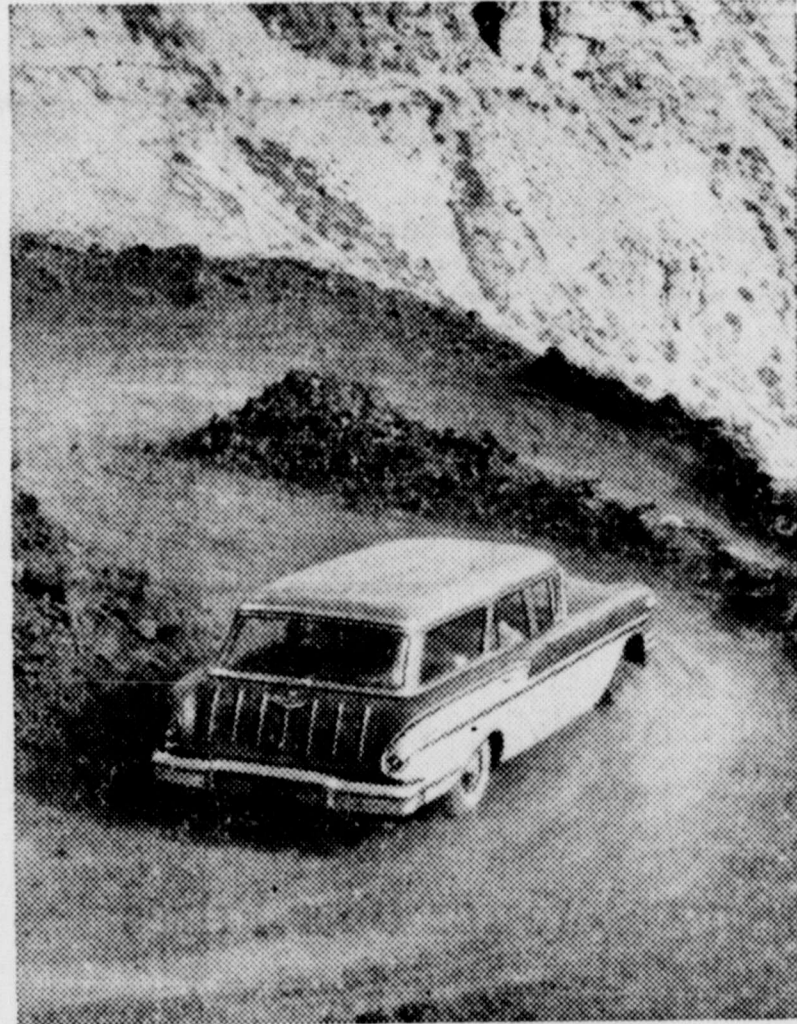
Grade Retarder gave extra braking on corkscrew descents.