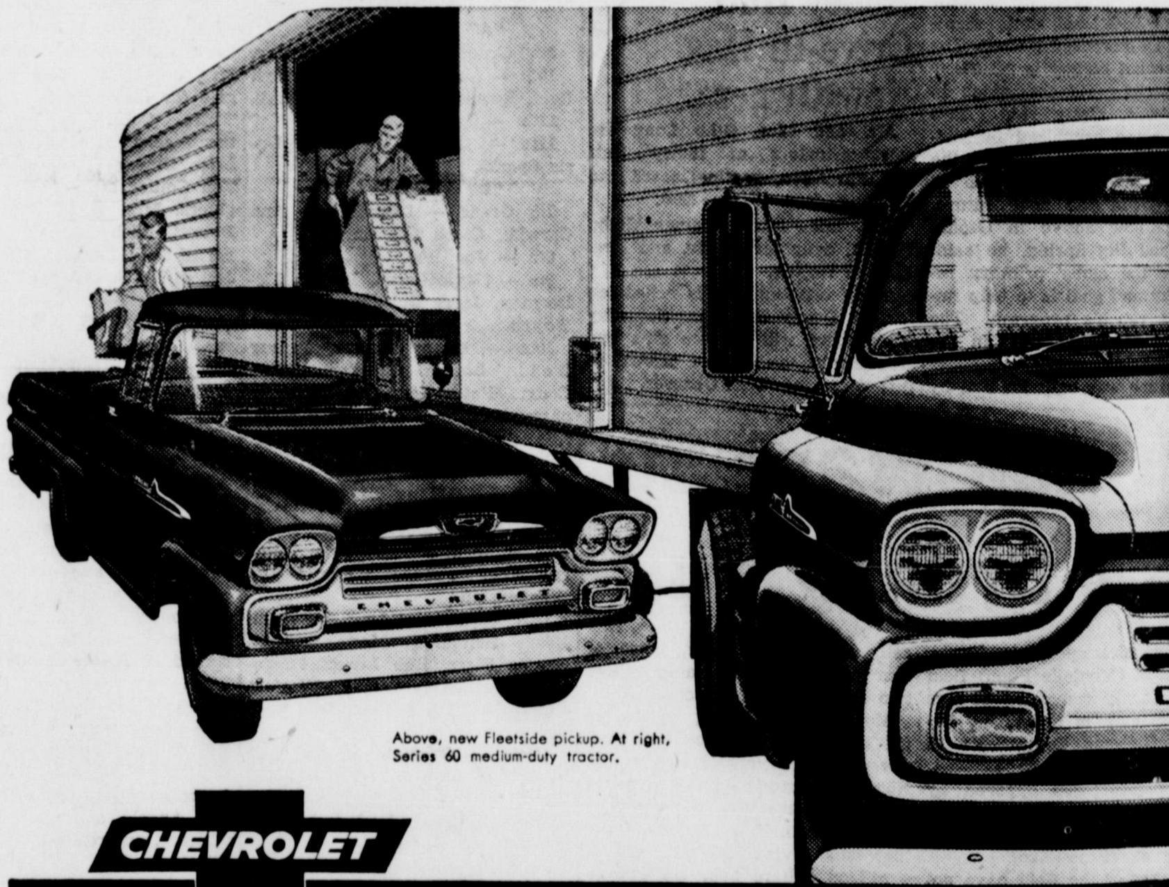
Above, new Fleetside pickup. At right, Series 60 medium-duty tractor.