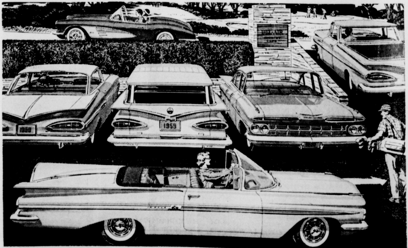
Your Chevrolet choice includes the Corvette, the Impala Sport Coupe, the Nomad Station Wagon, the Bel Air 4-Door Sedan, El Camino, and the Impala Convertible—all shown above.

now—see the wider selection of models at your local authorized Chevrolet dealer's!