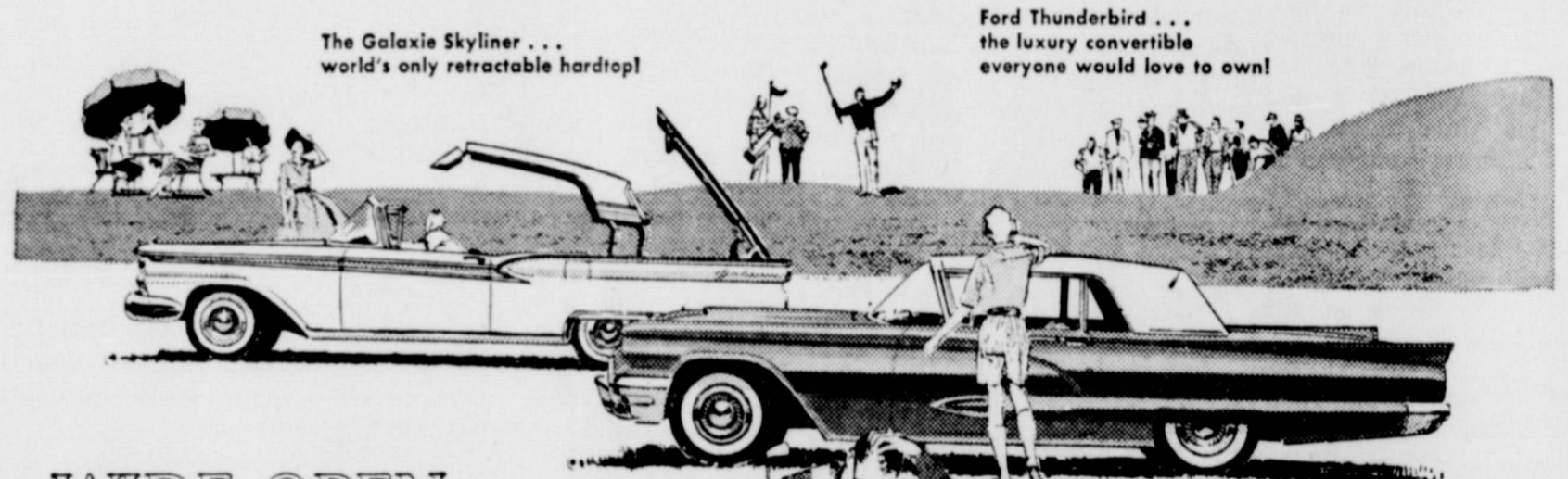
The Galaxie Skyliner . . . world's only retractable hardtop!