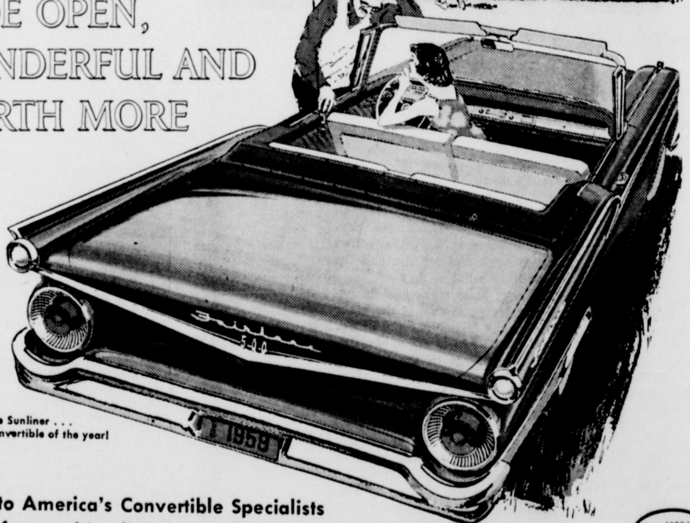
The Galaxie Sunliner . . . glamour convertible of the year!