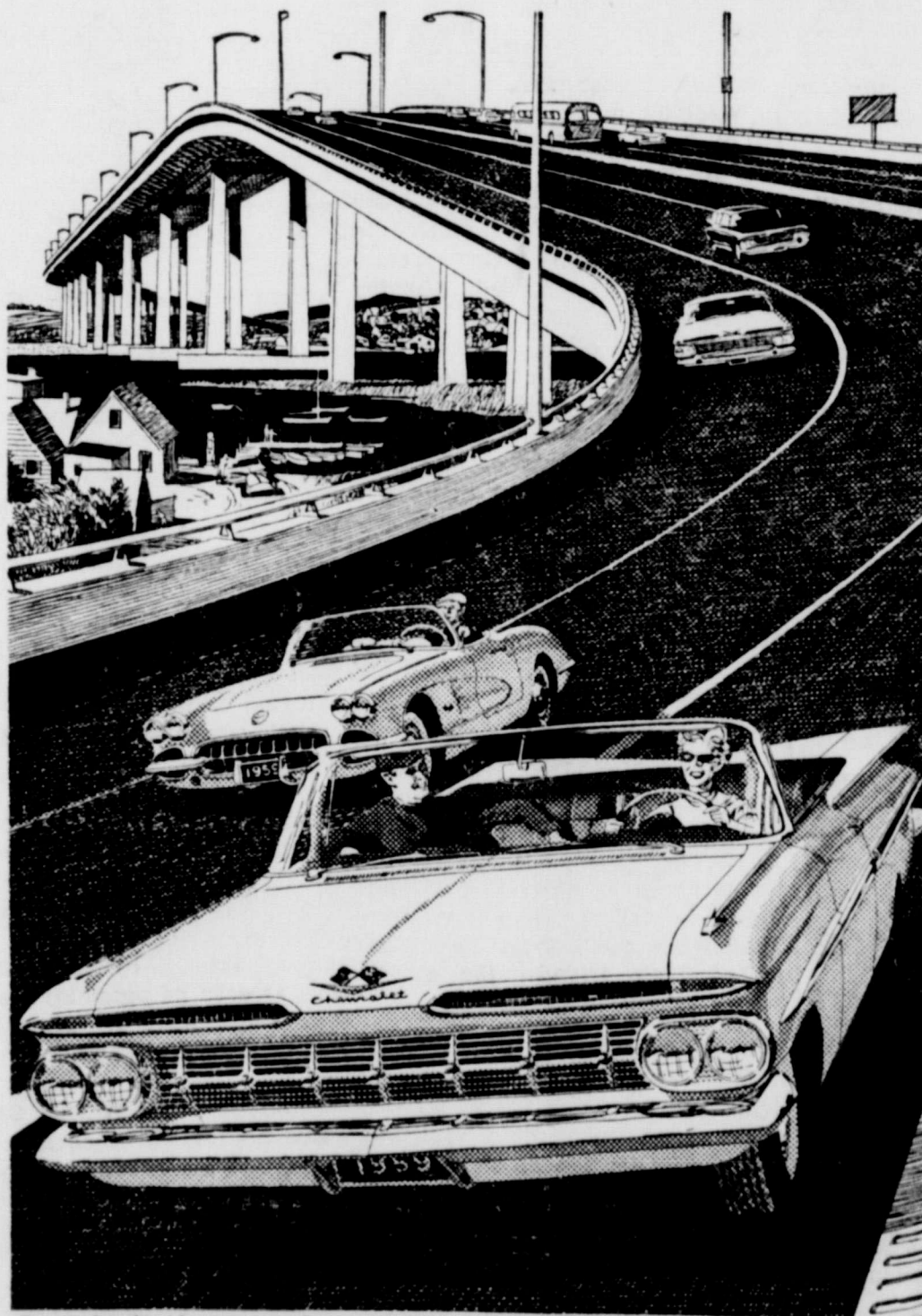
Open invitation to excitement, the Impala Convertible . . . and America's only authentic sports car, the Corvette.

One of 7 Big Bests Chevy gives you over any car in its field