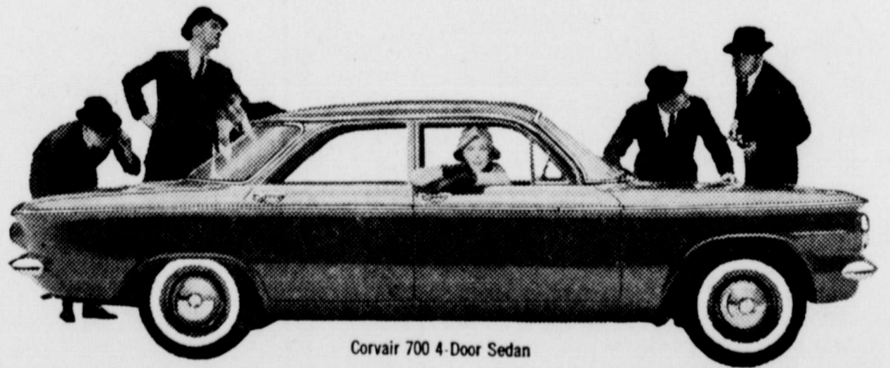
Corvaire 700 4-Door Sedan

Drive it—it's fun-tastic! See your local authorized Chevrolet dealer for fast delivery, favorable deals.