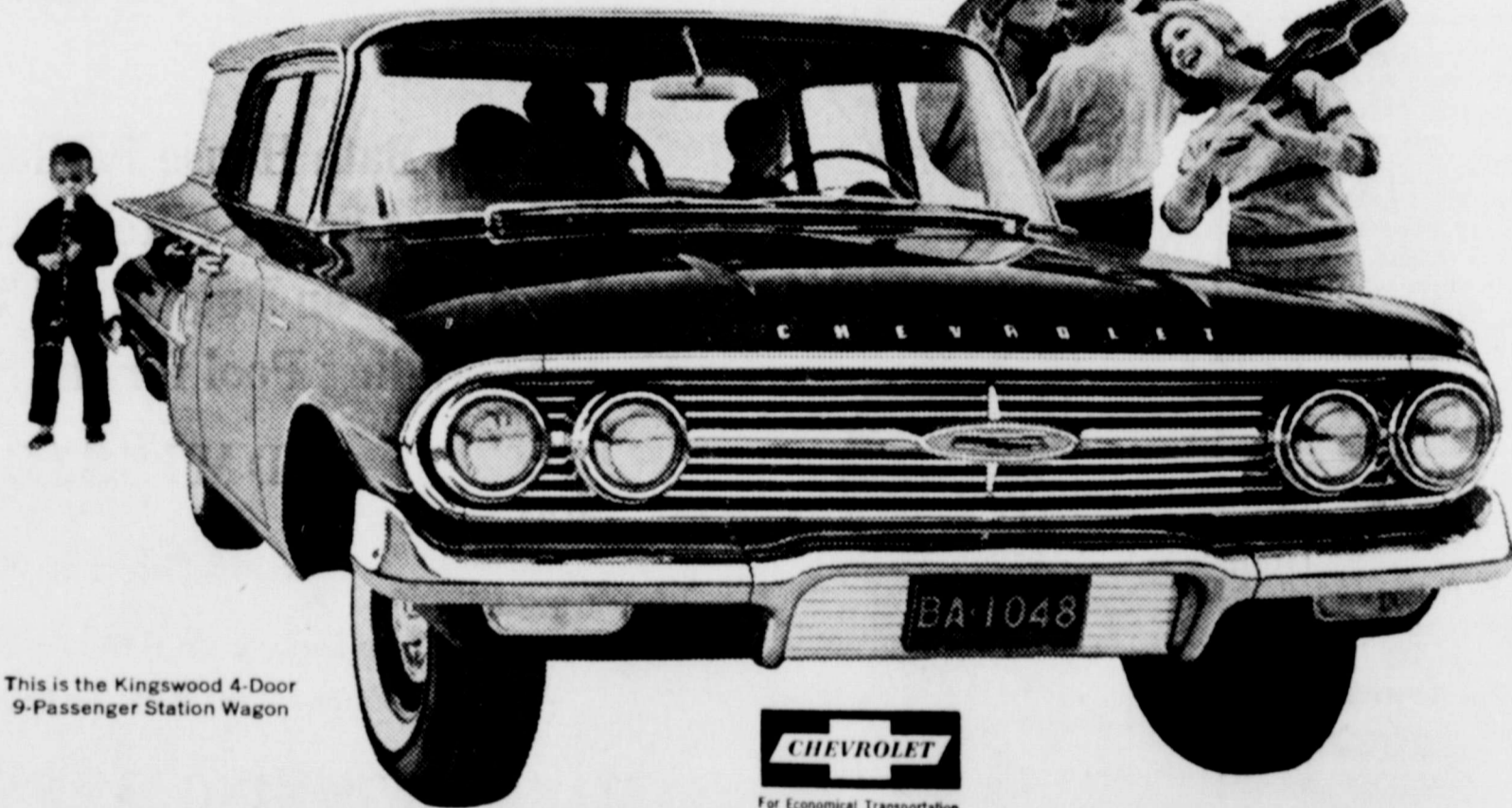
This is the Kingswood 4-Door 9-Passenger Station Wagon