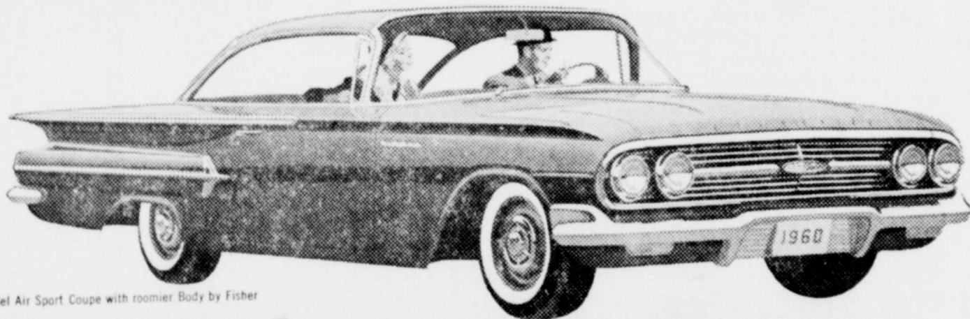
Bel Air Sport Coupe with roomier Body by Fisher

This year, more people are buying Chevrolets (including Corvairs) than ever before, making Chevy the year's hottest seller by a record-shattering margin. Come in and see what the buying's all about—at your Chevrolet dealer's soon!