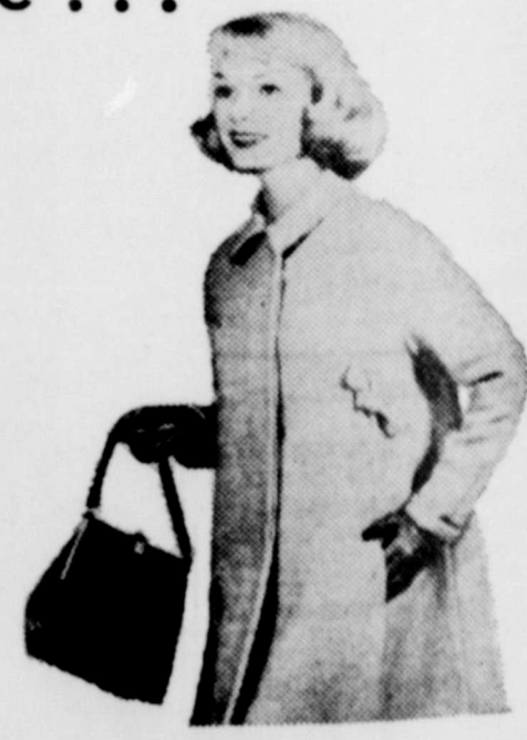
For The Woman On The Go ... The Medallion Home is built for the "Woman On The Ge" — with the completely automatic Electric Range she doesn't need to "sli" and watch her cooking — economical, too, for less than 3s the average family served by WTU can than 3s the average family served by WTU can cook a complete meal the modern electric way . . . and enjoy the convenience of electric living.