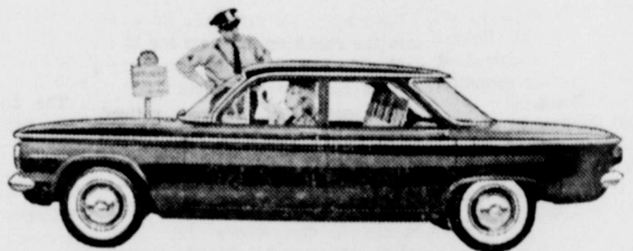
Corvair 700 4-Door Sedan—with a practically flat floor!

Sample the special delights of Corvair's light handling and quietness and all-round comfort. Take the wheel just once—and you'll know why the editors of Motor Trend magazine voted Corvair the Car of the Year. Your best bet by far is to drive a Corvair right now—while your Chevrolet dealer's writing year-end deals—and be all the more satisfied!