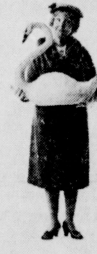
SMOOTHER RIDE. Like a swan on a pond. Try exclusive Cushion-Link ride (on Monterey, Meteor 800).