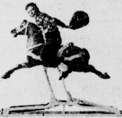
EXTRA PEP. Up to 10% more pickup than even last year's brilliant Mercury. Mercury's super-powered engines do the exceptional with matter-of-fact ease.