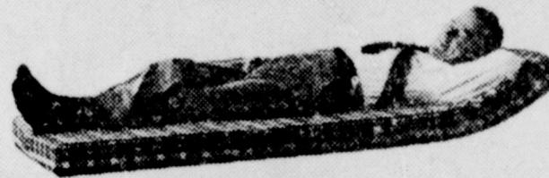
ALL-ROUND COMFORT. Relax. The ride is steady and quiet. Mercury has a longer wheelbase (120"), more weight, more insulation than competitive cars.

now available in the popular-price range!