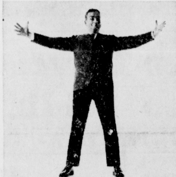
EXTRA ROOM. Mercury's famous room gets better every year. For '61 there's an even more spacious rear seat, wider doors, and a bigger trunk, (32 cubic feet).