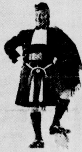
FAMOUS ECONOMY. Up to 15% better mileage than last year with new V-8's and Super-Economy "6".