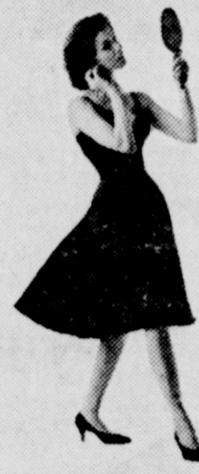
FAMOUS BEAUTY. No frills, no fads. Mercury's lines are trim, clean, classic—stay in style far longer.