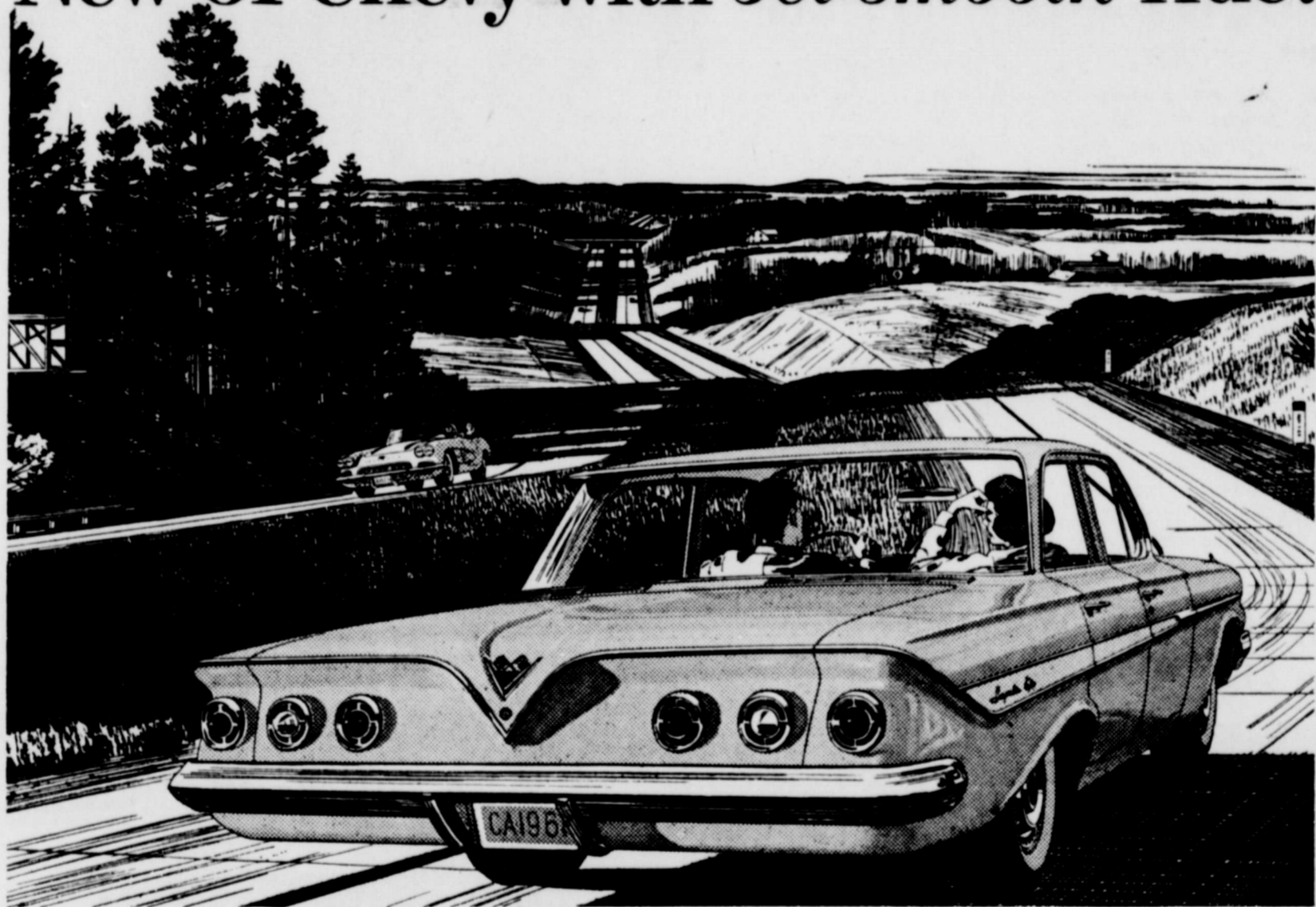
Impala 4-Door Sedan—Jet-smooth traveler that rivals the luxury cars in everything but price

The '61 Chevy loves to go because it goes so well. Purrs along pavements like a happy tabby. Takes rough roads in stride and all roads in style.