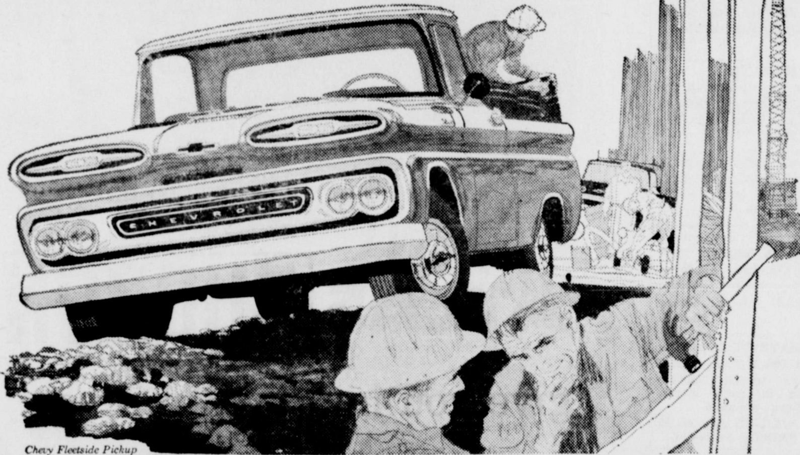
Chevy Fleece Pickup

You'll get the best buy on the best selling brand at your Chevy dealer's Truck Roundup!