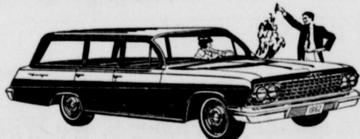
New Biscayne 4-Door 6-Passenger Station Wagon