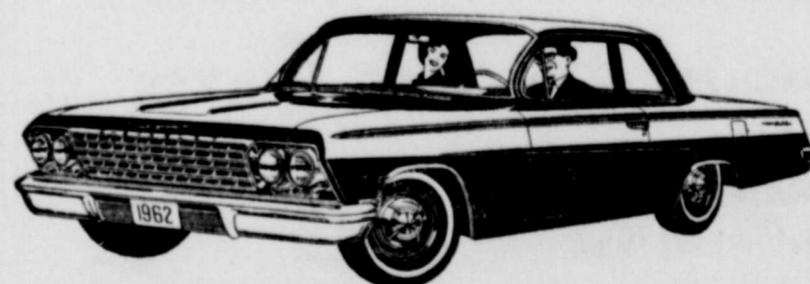
New Bel Air 2-Door Sedan

See the '62 Chevrolet, the new Chevy II and '62 Corvair at your local authorized Chevrolet dealer's