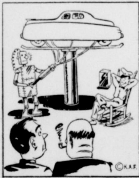
"It's his super lubricator."