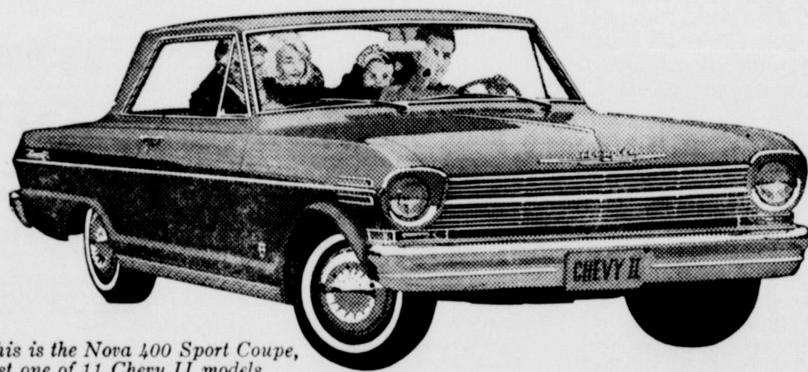
This is the Nova 400 Sport Coupe, just one of 11 Chevy II models you can pick from.

The men who know cars best put Chevy II to the test. And, after they had compared it with the rest of the '62 crop, the editors of Car Life magazine picked Chevy II for their coveted Engineering Excellence Award. Why? Here are some of the reasons in the editors' own words: "The Chevy II, in either 4- or 6-cylinder form, represents an important development in the American automotive field. The car is maximum transportation at