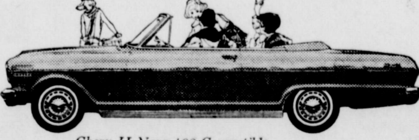
Chevy II Nova 400 Convertible

See the new Chevy II, new Chevrolet and new Corvair at your local authorized Chevrolet dealer's