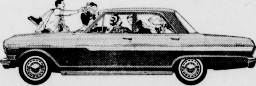
Chevy II Nova 400 4-Door Sedan