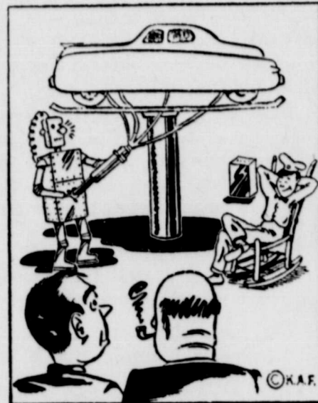
"It's his super lubricator."

Mueller Sheet Metal, Home Furniture, King-Holt Furniture, Higginbothams, Heidenheimer's, and George's, all of Ballinger.