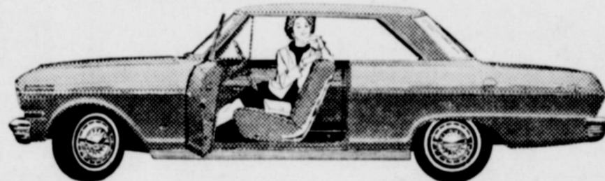
Chevy II Nova 400 Sport Coupe