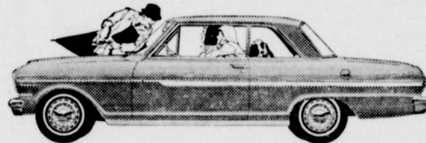
Chevy II Nova 400 2-Door Sedan