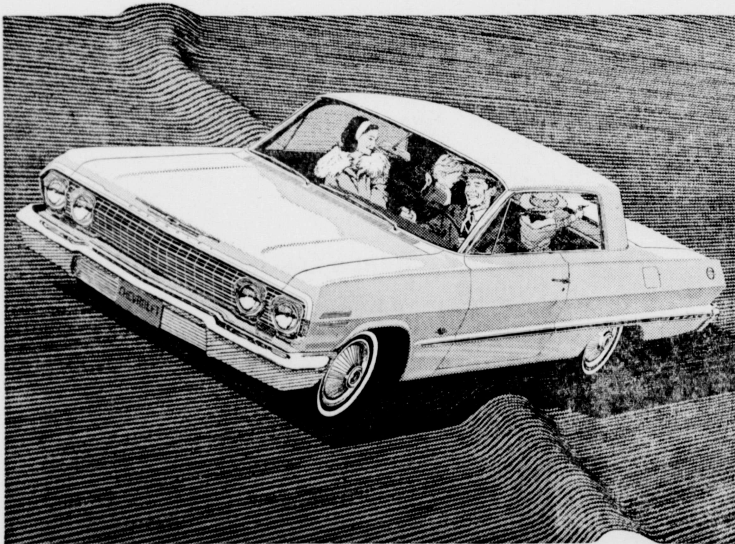
'63 Chevrolet Impala Sport Coupe