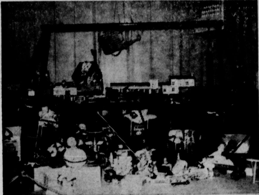
Repairing, refinishing, and pinch hitting for Santa Claus, the Silver Lions Club made the rounds in Robert Lee on Christmas eve with the above pictured stock of toys.