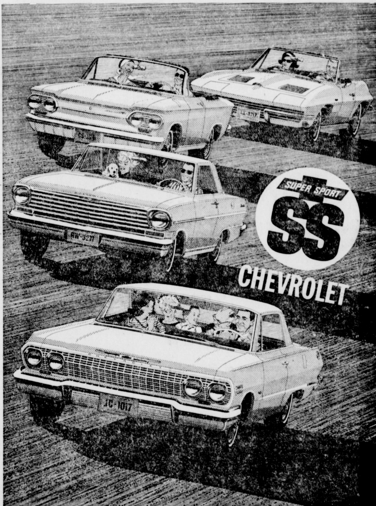
Pictured from top to bottom: Corvette Sting Ray Convertible, Corvair Monza Spyder Convertible, Chevy II Nova 400 SS Coupe, Chevrolet Impala SS Coupe. (Super Sport and Spyder equipment optional at extra cost.)

seats. It even offers a new Comfortilt steering wheel* that positions right where you want it. ■ The new Chevy II Nova SS has its own brand of excitement. Likewise the turbo-supercharged rear-engine Corvair Monza Spyder and the all-new Corvette Sting Rays. Just decide how sporty you want to get, then pick your equipment and power—up to 425 hp in the Chevrolet SS, including the popular Turbo-Fire 409* with 340 hp for smooth, responsive handling in city traffic. *optional at extra cost