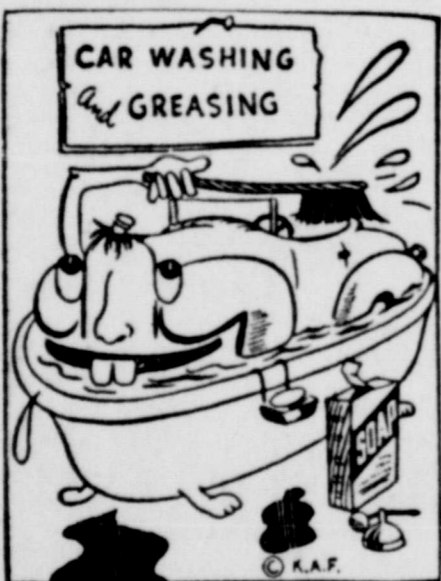
"Come on in, the washin's fine."

Car washing and lubrication are specialized services with us. We have the right lubricant and we KNOW where it should go. When we wash your car, we CLEAN it inside and out.