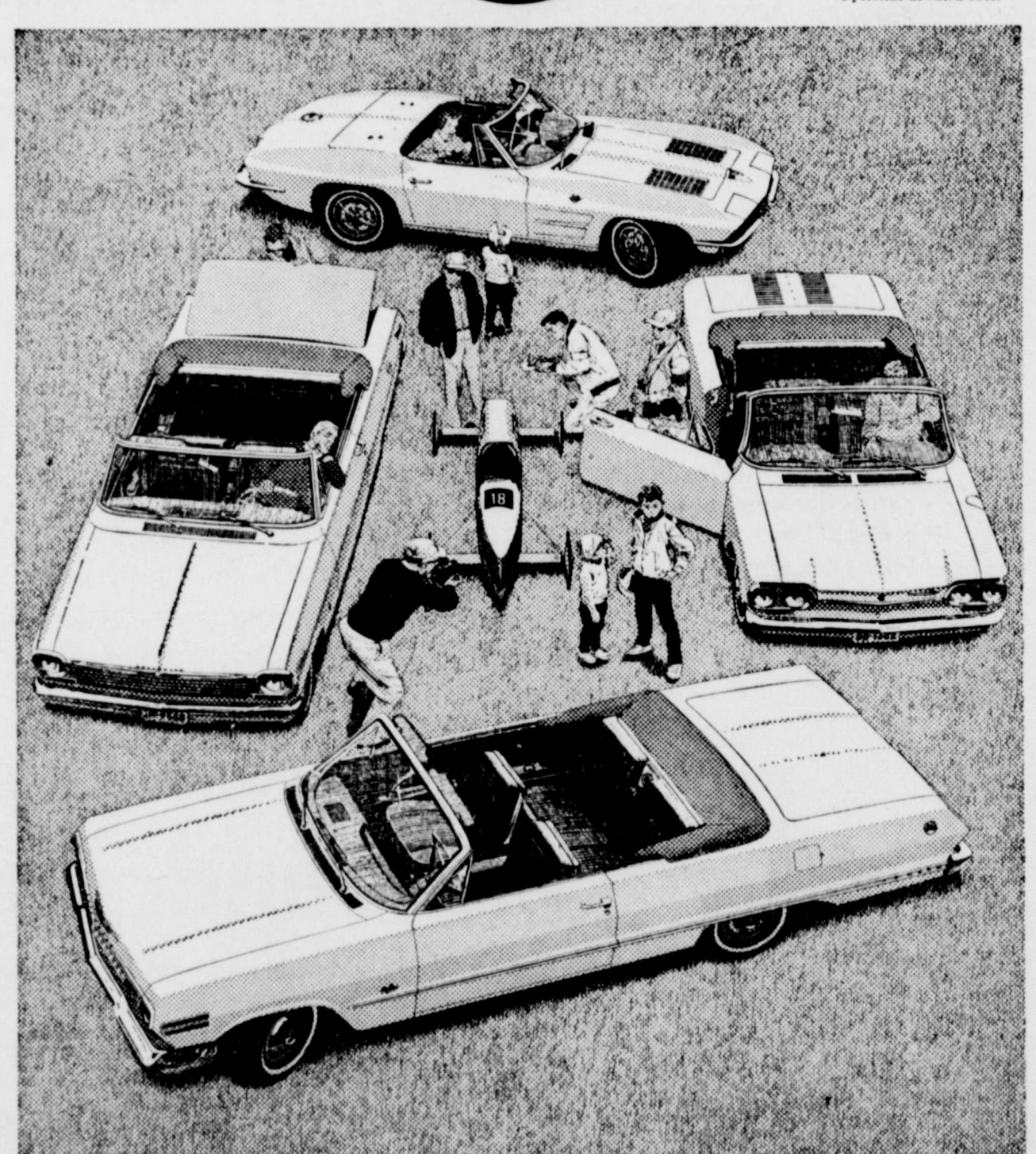
Modets snown clockwise: Corvette Sting Ray Convertible, Corvair Monza Spyder Convertible, Chevrolet Impala Super Sport Convertible, Chevy II Nova 400 Super Sport Convertible. Center: Soap Box Derby Racer, built by All-American boys.