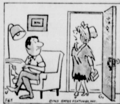
"Well, we're a one-car family again!"