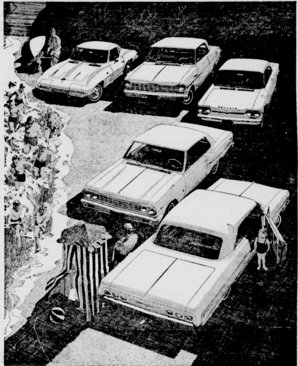
Sport Coupes above: Corvair Monza, Chevy II Nova, Corvair Monza, Chevelle Malibu, Chevrolet Impala.