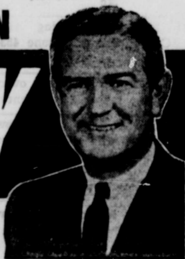
-paid pol. ad.