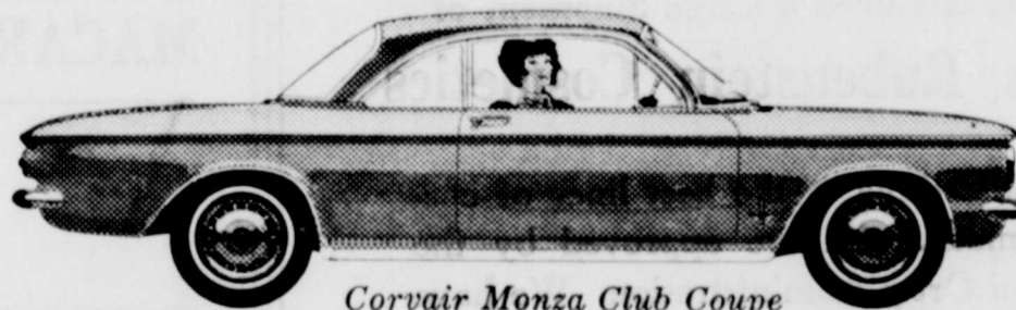
Corvair Monza Club Coupe

Chevrolet has brought a whole new kind of excitement to everyday driving this year—with 5 different lines of cars and 45 different models.