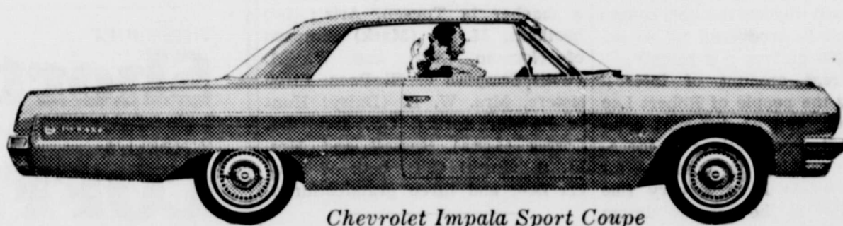
Chevrolet Impala Sport Coupe

Chevrolet dealers sell more cars than anybody Because they sell great cars