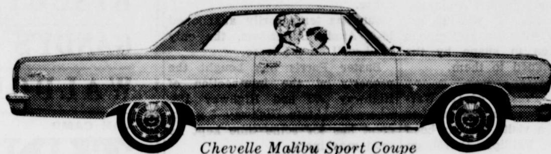
Chevelle Malibu Sport Coupe