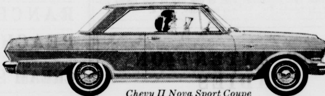
Chevy II Nova Sport Coupe