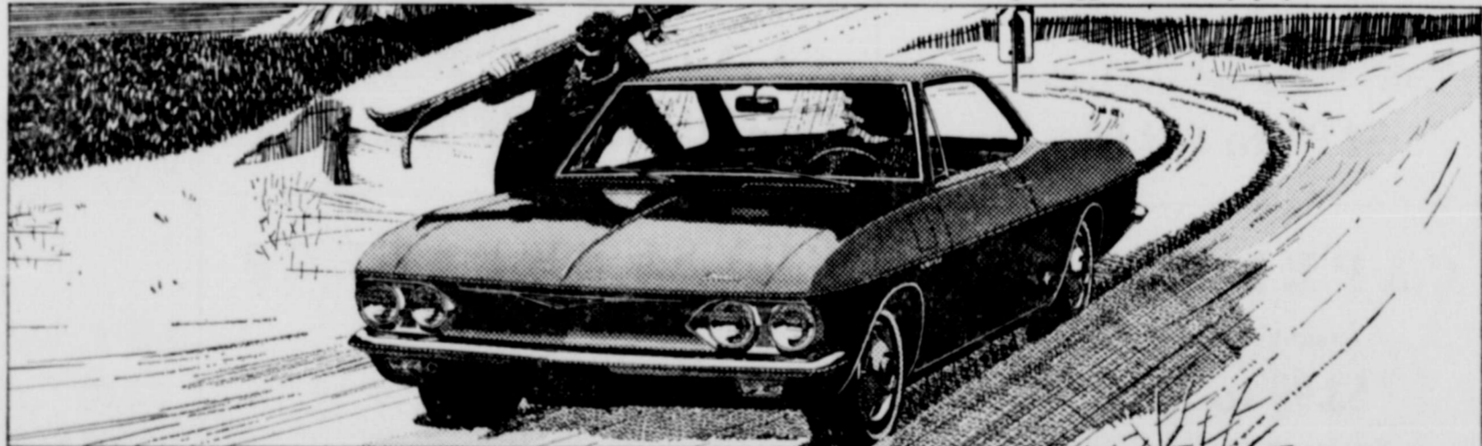
CORVAIR —The only rear engine American car made. Corvair Corsa Sport Coupe

When you take in everything, there's more room inside this car than in any Chevrolet as far back as they go. It's wider this year and the attractively curved windows help to give you more shoulder room. The engine's been moved forward to give you more foot room. So, besides the way a '65 Chevrolet looks and rides, we now have one more reason to ask you: What do you get by paying more for a car—except bigger monthly payments?