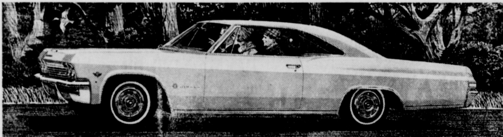
CHEVROLET —As roomy a car as Chevrolet's ever built. Chevrolet Impala Sport Coupe

When you take in everything, there's more room inside this car than in any Chevrolet as far back as they go. It's wider this year and the attractively curved windows help to give you more shoulder room. The engine's been moved forward to give you more foot room. So, besides the way a '65 Chevrolet looks and rides, we now have one more reason to ask you: What do you get by paying more for a car—except bigger monthly payments?