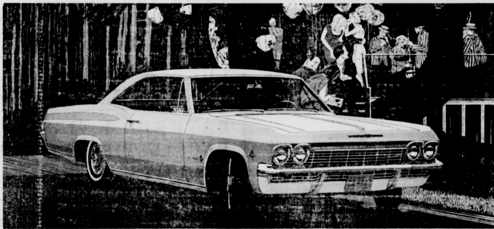
Sporty Swinger! '65 Chevrolet Impala Sport Coupe